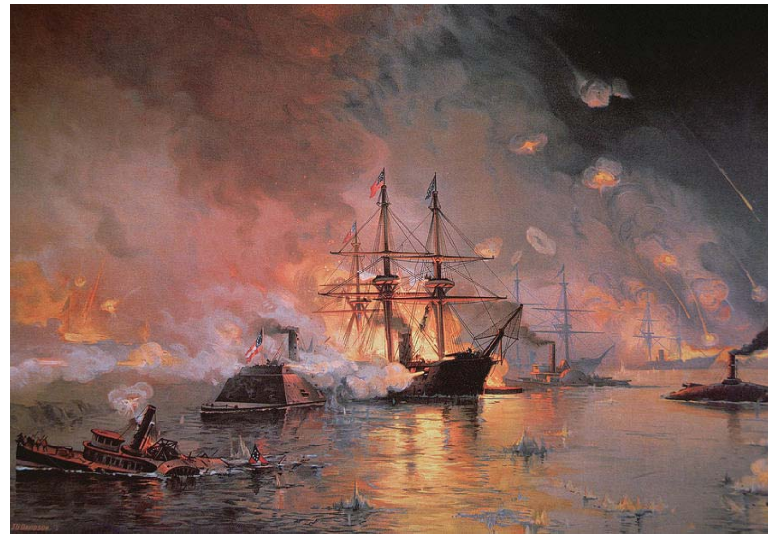
Figure 3. Capture of New Orleans by Union Flag Officer David G. Farragut, painting by Julian Oliver Davidson.

captured by Union forces April 15-May 1, 1862. The capture of the largest Confederate city was a major turning point in the war and of importance due to its heavy international commerce.