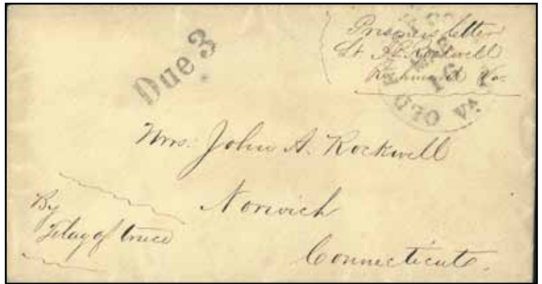
Figure 10: A prisoner-of-war cover with the large Old Point Comfort canceling device used early in the war.

I am grateful to Robert A. Siegel Auction Galleries for the majority of the images used in this article. My thanks also to the Library of Congress.