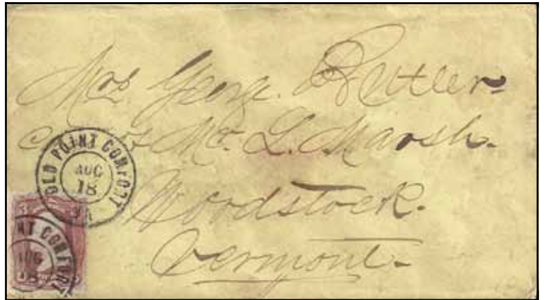
Figure 11: A Union use from Old Point Comfort with no Confederate connection.