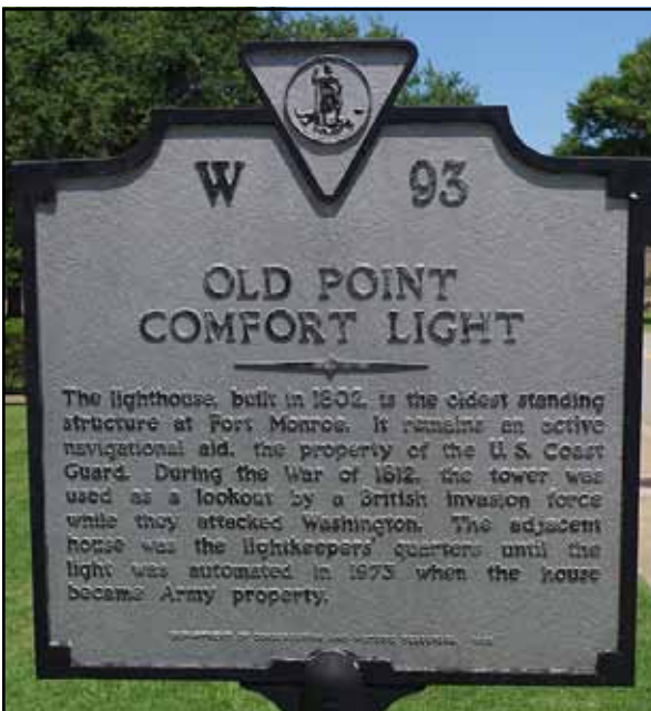
A Virginia historical marker at Old Point Comfort.