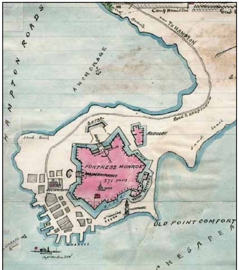
Figure 3: An 1862 map of Fort Monroe by Robert Knox Sneden showing casemated water battery, redoubt, and gorge position, the first two protected by secondary moats.