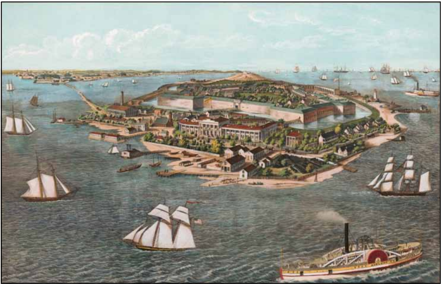
Figure 2: An 1861 Magnus print of Fortress Monroe and Old Point Comfort.