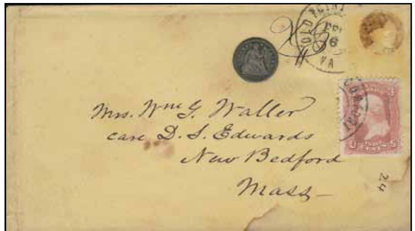
Figure 7: A South to North cover franked with a three-cent rose and tied by a OPC double-circle datestamp on a flag-of-truce cover to New Bedford, Mass. A half-dime paid the postage.