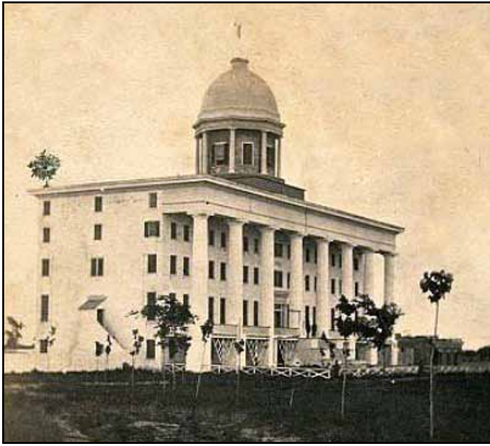
Figure 9: A wartime view of Chesapeake Hospital in Hampton, Virginia.

to Southern exchange points on the James River. A Library of Congress photo shows the New York at Aikens Landing waiting for exchanged prisoners; it was taken some time between 1861-65.