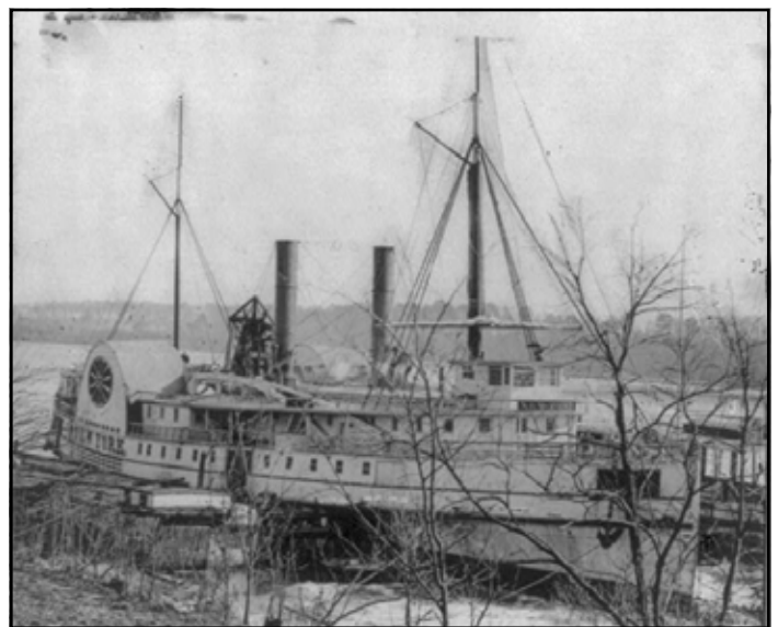
Figure 4: The flag-of-truce boat New York docked at Aikens Landing while waiting for exchanged prisoners.

The principal Northern exchange point during most of the war for through-the-lines mail was Fortress Monroe at Old Point Comfort. The New York , a Union flag-of-truce boat shown in Figure 4, was used for the exchange of prisoners and mail. The double-stacked, side-wheel steamer ran regularly from Fortress Monroe