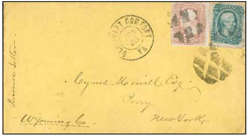
Figure 5: An Andersonville Prison cover showing frankings of both the United States and Confederacy on one cover, contrary to regulations mandating a two-envelope system with the outer envelope to be discarded at the exchange point