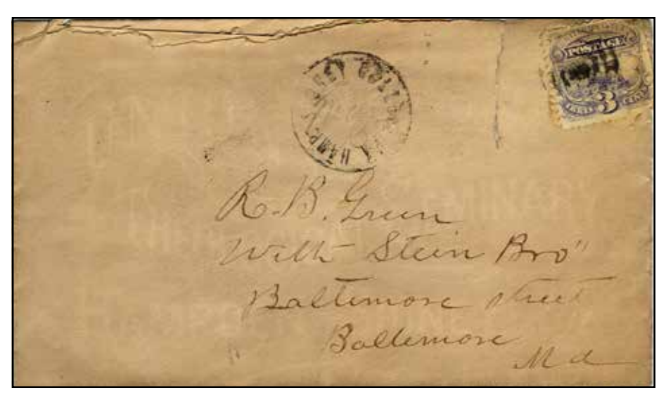
postwar use that is shown in Figure 5. Figure 5: A three-cent 1869 issue tied by a target cancel and postmarked with a The all-over design is very pale so Hampden-Sydney College circular datestamp on the only recorded advertising cover from the institution.