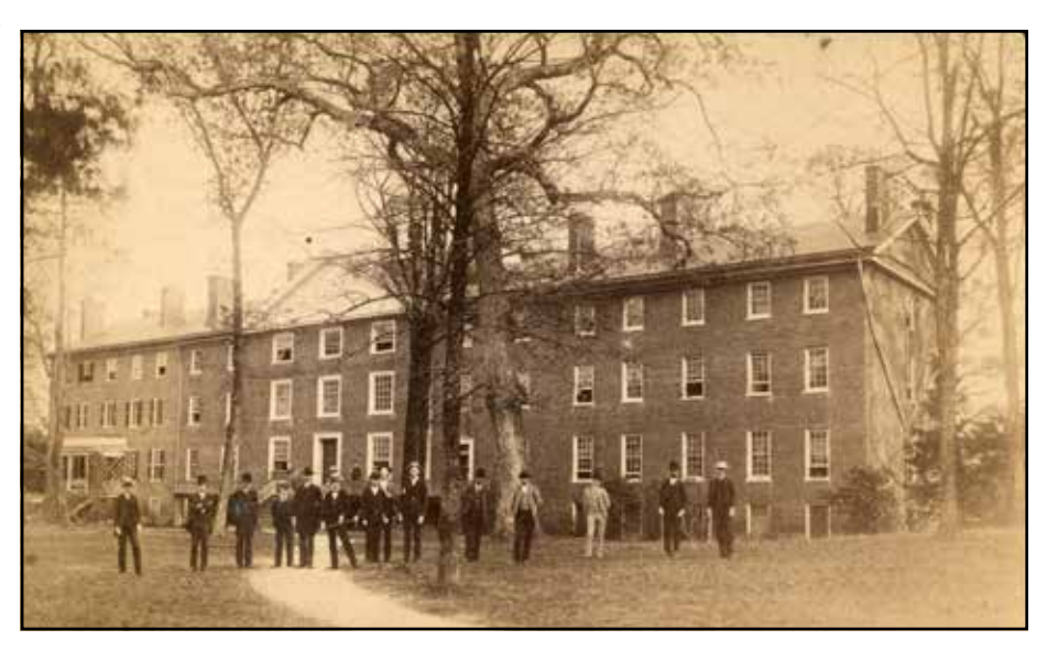
Ricard Rees, one of the largest Figure 6: A cabinet card photograph of Union Theological Seminary by photographers in Richmond Rees photographer C.R. Rees, circa 1890.