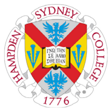
Figure 2: The Hampden-Sydney College coat of arms.

immediately recognizable as Jefferson's handiwork, with a decided likeness to Jefferson's nearby home of Monticello.