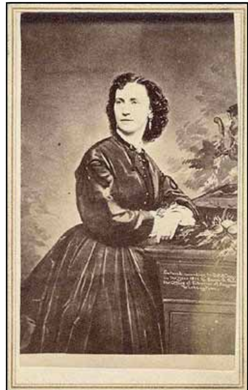
Figure 7: Murderer Laura D. Fair, as shown in her carte-de-visite

The move to Nevada became necessary after California passed a law prohibiting the practice of law