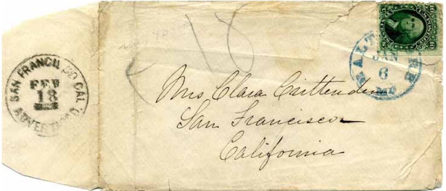
Figure 1: A cover smuggled across the lines from the South to Baltimore, where it was posted to San Francisco with a 10-cent green (Scott 68).