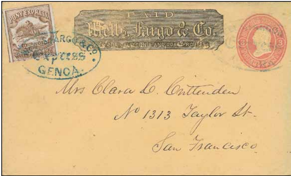
Figure 5: Wells, Fargo & Co., Pony Express 10-cent brown (Scott 143L7) with markings of both Wells Fargo's Aurora and Genoa offices.