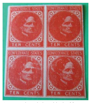
Figure 3. Altered plate, block of four.

Altered Plate. This describes a printing plate (as opposed to an original die) upon which the denomination was deliberately altered. It is commonly used to refer to the 2¢ and 10¢ De La Rue denominations created by altering the 1¢ and 5¢ plates. These were printed from genuine printing plates that were created, but never put into use by the Confederate Post Office Department.