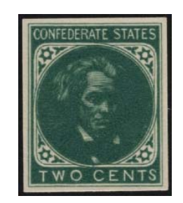
Figure 2. Altered plate.

Figure 2 shows another misdescribed stamp. It is the 2¢ Altered Plate, described as "United States CSA FANTASY DIETZ 9A VF." No further description is offered – just the heading.