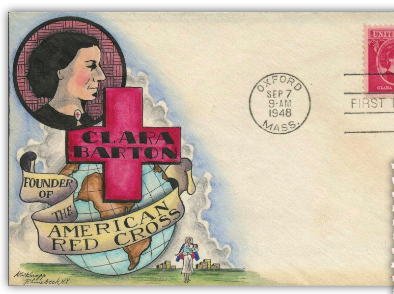
Figure 5 (above). Dorothy W. Knapp illustrated first day cover, Oxford, Massachusetts, September 7, 1948.

Figure 6 (right). Commemorative 3¢ stamp honoring Clara Barton, 1948.