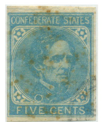
Figure 4 (below). Used example of a brass rules variety; none are recorded as used in the 2012 CSA Catalog.

easily seen in the "FIVE" carrying over to "CENTS." The