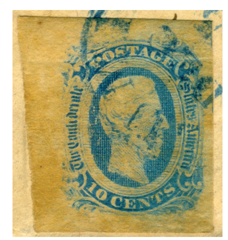
Figure 2. Close-up of Figure 1 Type II 10¢ blue engraved issue showing a short transfer at left.

The stamp in Figure 4 is a Richmond print on De La Rue paper with a brass rule at the top. The brass rule is listed