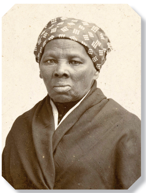
Figure 8. Harriet Tubman, circa 1895, known as "Moses" because she led slaves to freedom from Maryland through Delaware North on the Underground Railroad before and during the Civil War.

Figure 9. U.S. 3¢ rose (Scott 65) tied on cover with a blue cork cancel and postmarked Georgetown, Del., Feb. 20 (1862-63); it is addressed to Capt. C. Rodney Layton, Company F, 11th U.S. Infantry, Army of the Potomac, New Potomac Creek, Va.