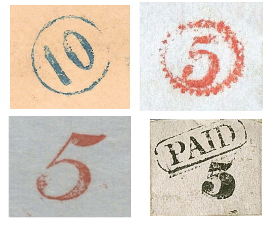
Figure 1A (top left). Clipped slip of paper with blue "10" in circle.

The Oakway is a circular-cut handstamped adhesive tied by a manuscript "Paid" with a matching "Oakway S.C./Sept. 18, 1861" manuscript postmark used on a cover to James E. Hagood at Pickens Court House, S.C. It is from a well-known correspondence. Receipt docketing on the back indicates J.B. Sanders, the Oakway postmaster, was the sender.