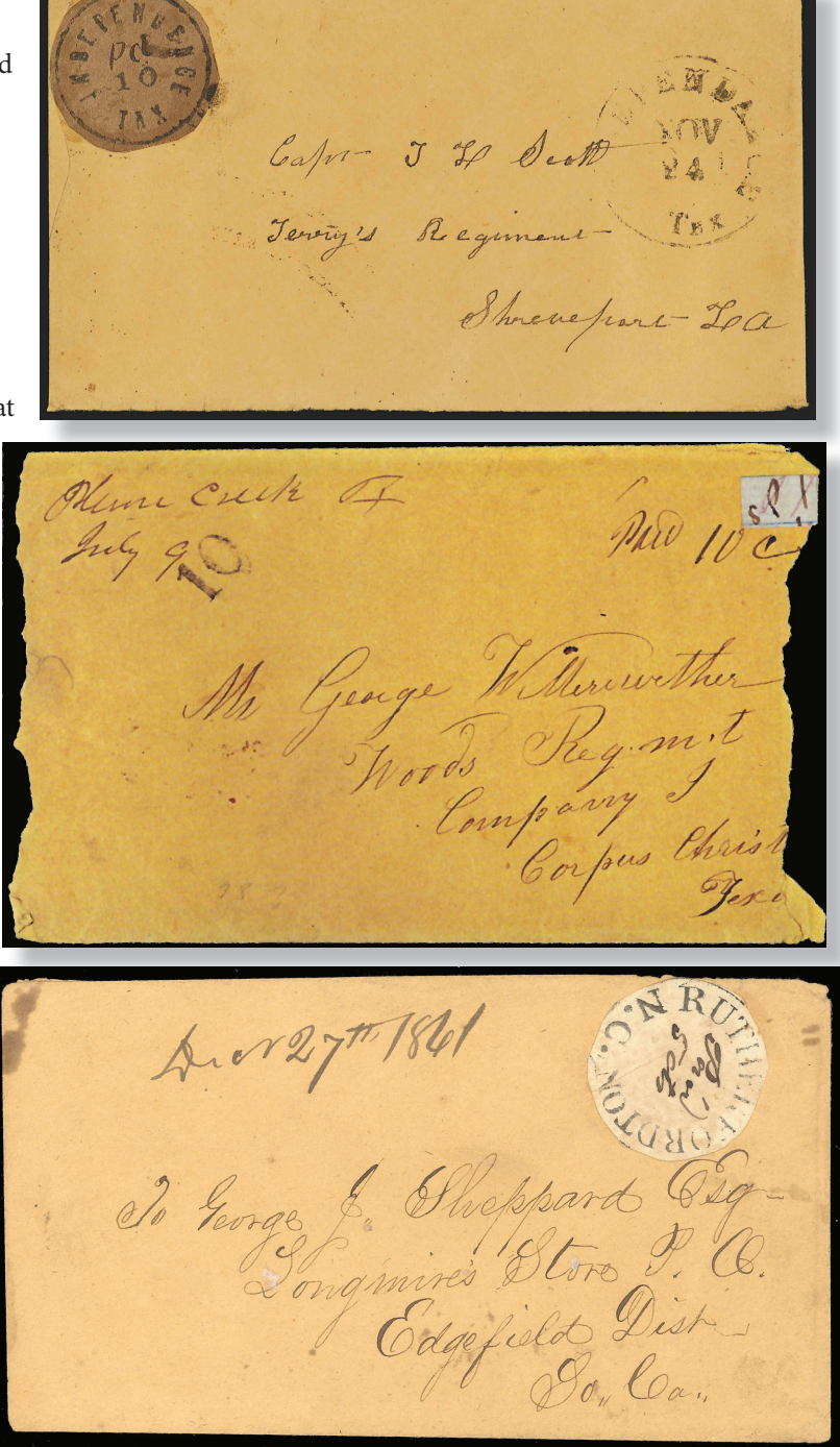
Figure 7 (top). Independence, Texas, 10¢ provisional (Scott 41X1) used on cover. Figure 8 (center). Plum Creek, Texas, 10¢ provisional (Scott 141X1), prepared by writing the rate in ink on paper with ruled lines and cutting out the slips of paper as needed. Figure 9 (above). Rutherfordton, N.C., 5¢ provisional (Scott 72X1) is an undated office postmark with separately added "Paid / 5 cts" at the center. Would this have stood a

Acknowledgements: Robert A. Siegel Auction Galleries for use of its database and images. The numbers used throughout this article in parentheses are Scott catalog numbers.