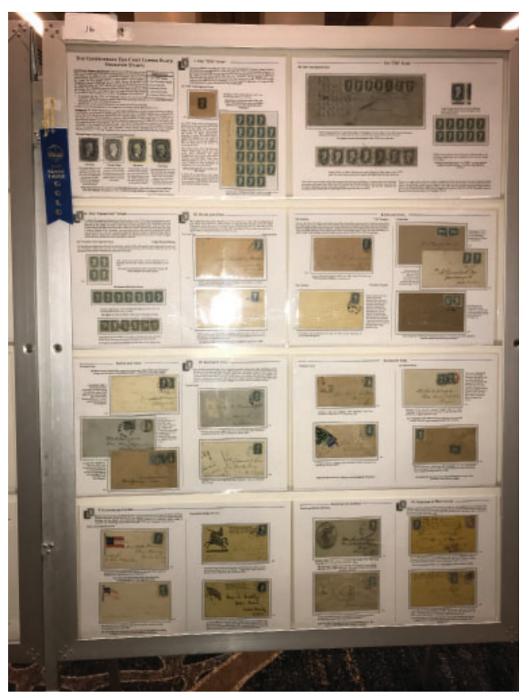
Dan Ryterband's impressive one-frame large-gold exhibit, The Confederate Ten-Cent Copper Plate Engraved Stamps .