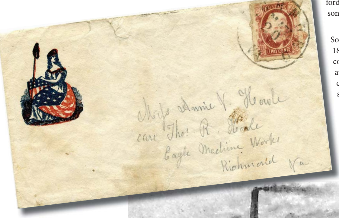
Figure 1 (above). Confederate use of Northern patriotic cover addressed to Eagle Machine Works.

The United States Agricultural Society (USAS) was founded in 1852. Twelve different states in the country had agricultural societies at that time. They decided to become one unit, the USAS. It was started at a time when there was no Department of Agriculture in the United States. Abraham Lincoln established an independent Department of Agriculture on May 15, 1862.<sup>3</sup>