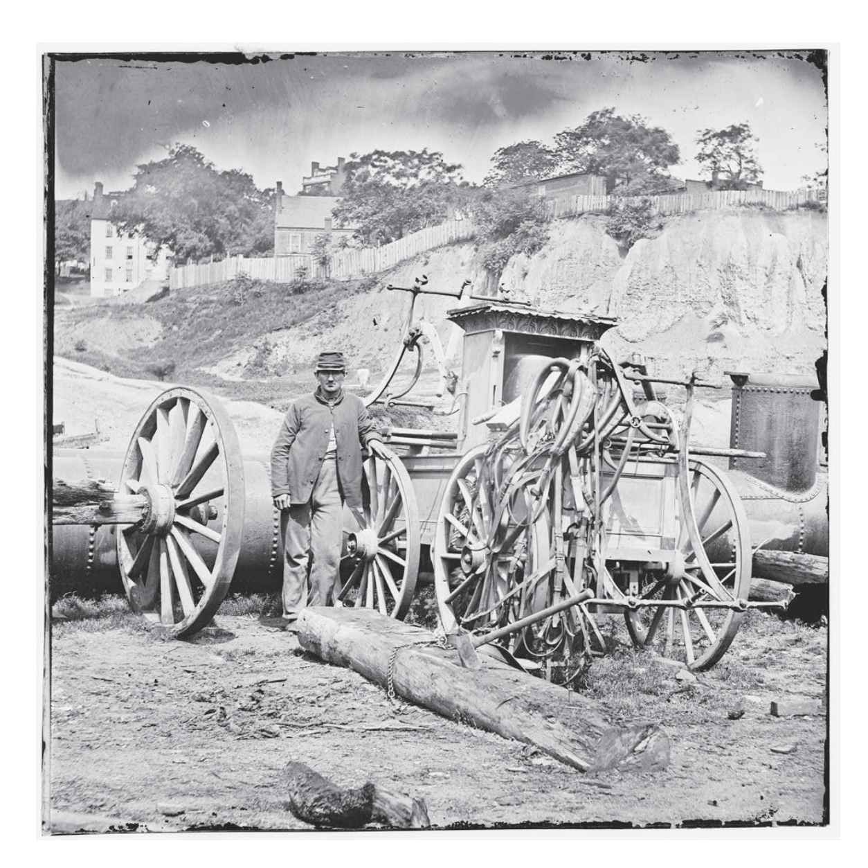
Figure 6. Richmond Fire Engine No. 3, fallen Richmond, April-June 1865.

Philip's son, Adolphus, was released from the Confederate Army to run the factory. The factory was then destroyed by the great fire that engulfed Richmond at the time of the Confederate withdrawal from the city in April 1865.