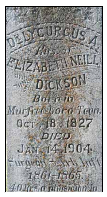
Figure 4: Gravestone of Dr. Lycurgus Adair Dickson at Oak Lawn Cemetery, Batesville, Arkansas.