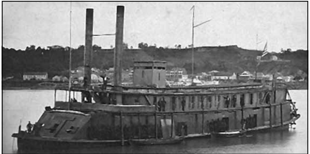
Figure 5: The USS Rattler, the flagship of the Mississippi Squadron,

The regiment was arranged into six companies of about 1,000 men from Cherokee, Smith, and Red River. On April 24, 1862, the regiment was dismounted and sent to Arkansas where it was assigned to First Brigade, Second Division, Trans-Mississippi Department.