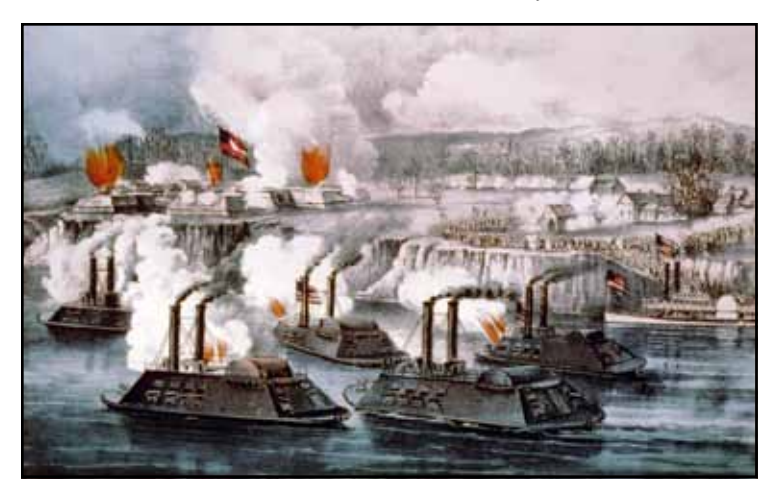
Figure 4: Currier & Ives print of the bombardment and capture of Fort Hindman, Arkansas Post, on January 11, 1863.