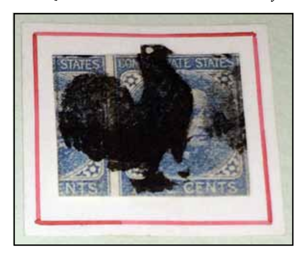
Figure 5: A bogus 'chicken' cancellation on a Confederate local printing from the Tapling collection.

time, you amass more and more information (the cause of "senior moments?") and your brain unconsciously organizes it into patterns. When you see something new whose details fit into those patterns, you instantaneously make that association. That is what we call intuition; it is centered in the brain, not the gut.