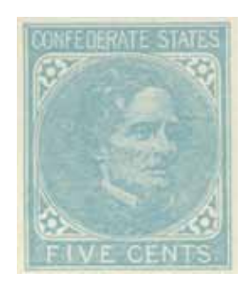
Figure 3: Ward reprint, also known as the Philadelphia reprint.