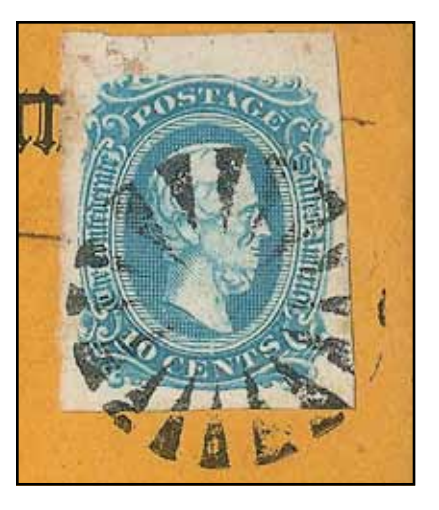
Figure 6: A genuine Harrisonburg, Virginia, circle of wedges cancellation.

When I saw Stroupe's copy, I about did back flips because I knew of another cover that