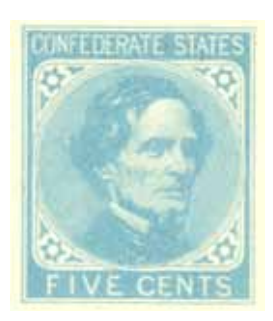
Figure 1: CSA Scott 6, the 5-cent London printing.