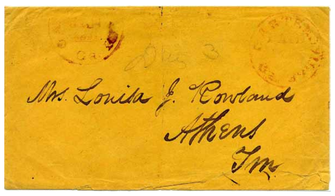
Figure 1: Cartersville, Georgia, (five-cent) red handstamped provisional entire (CSA Scott 126XU1) with 'Due 3' applied in pencil, as the Confederate rated postage was not recognized in Tennessee in early June when Tennessee was still under U.S. postal control.