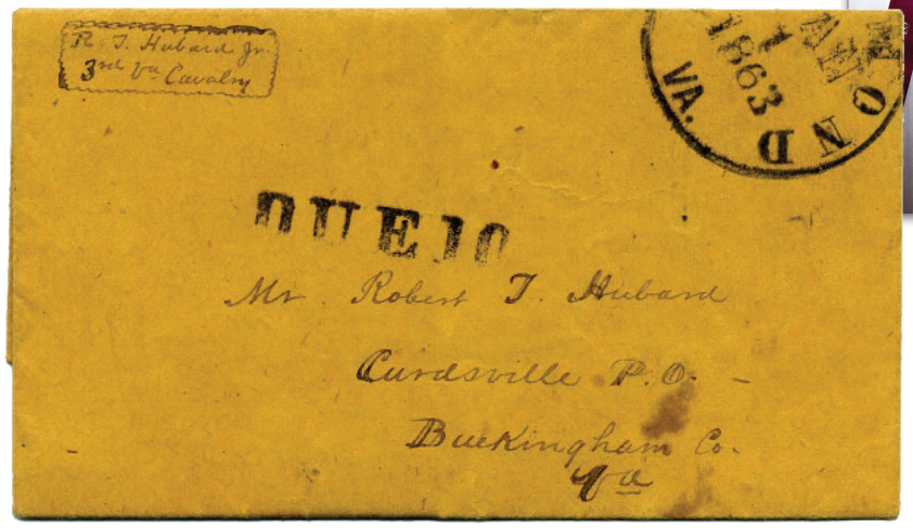
Figure 3. Richmond, Virginia, soldier's letter. Content drives the price to $300, rather than the markings on the cover.