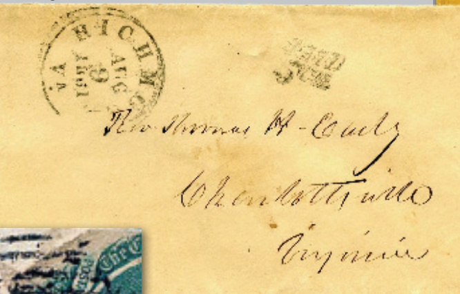
Figure 5. PAID 10 stampless cover from Richmond, Virginia, in poor condition.

Figures 6, 7, 8. Examples of Confederate Army field cancels. CSA catalog types ANV-11, ANV-18, and ATN-b.