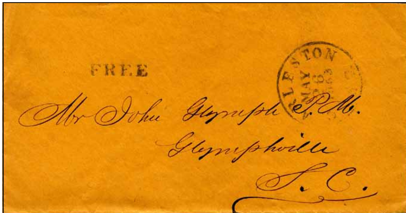
Figure 1: This appears to be a May 26, 1863, Charleston, S.C., Confederate dated cover with a straightline 'FREE' handstamp. Or is it?