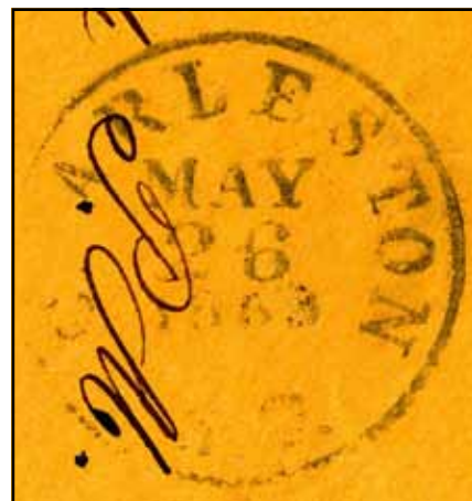
Figure 2: A close-up of the circular date stamp in Figure 1.

This included all laws governing the Post Office Department and its operation that were in effect under the United States government on November 1, 1860. The Post Office Department's October 1, 1861, instructions to postmasters expanded on this by stating