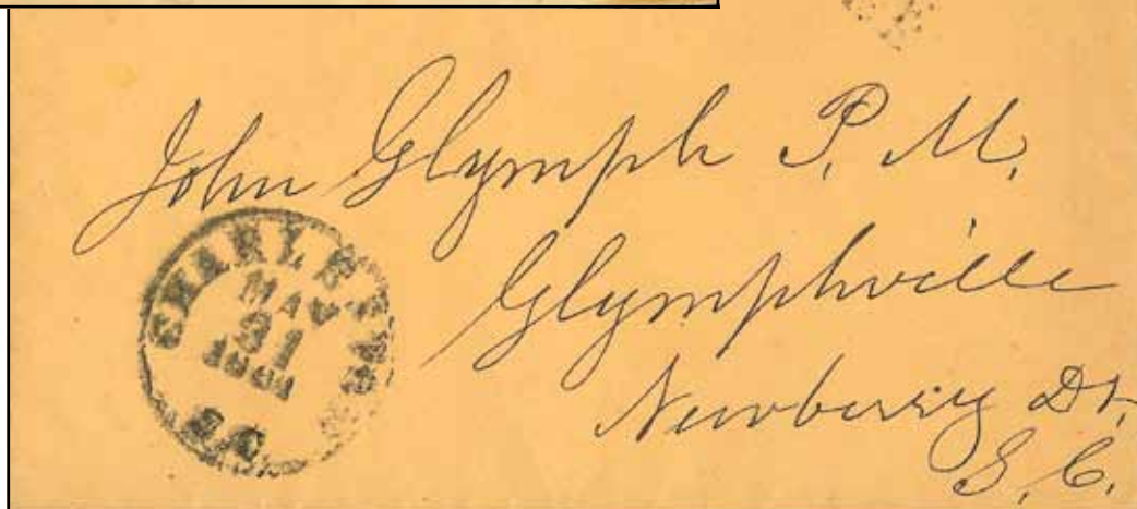
Figure 6: Almost a twin for the cover in Figure 1, this is purported to be the only recorded example of the Charleston handstamped “FREE” marking used during the Confederate period.

There are three major strikes against the Figure 1 wanna-be cover as a Confederate use: