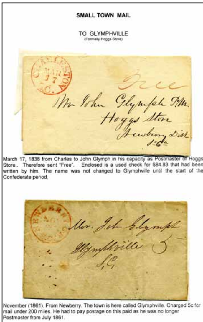
Figure 3: An exhibit page full of half-truths.