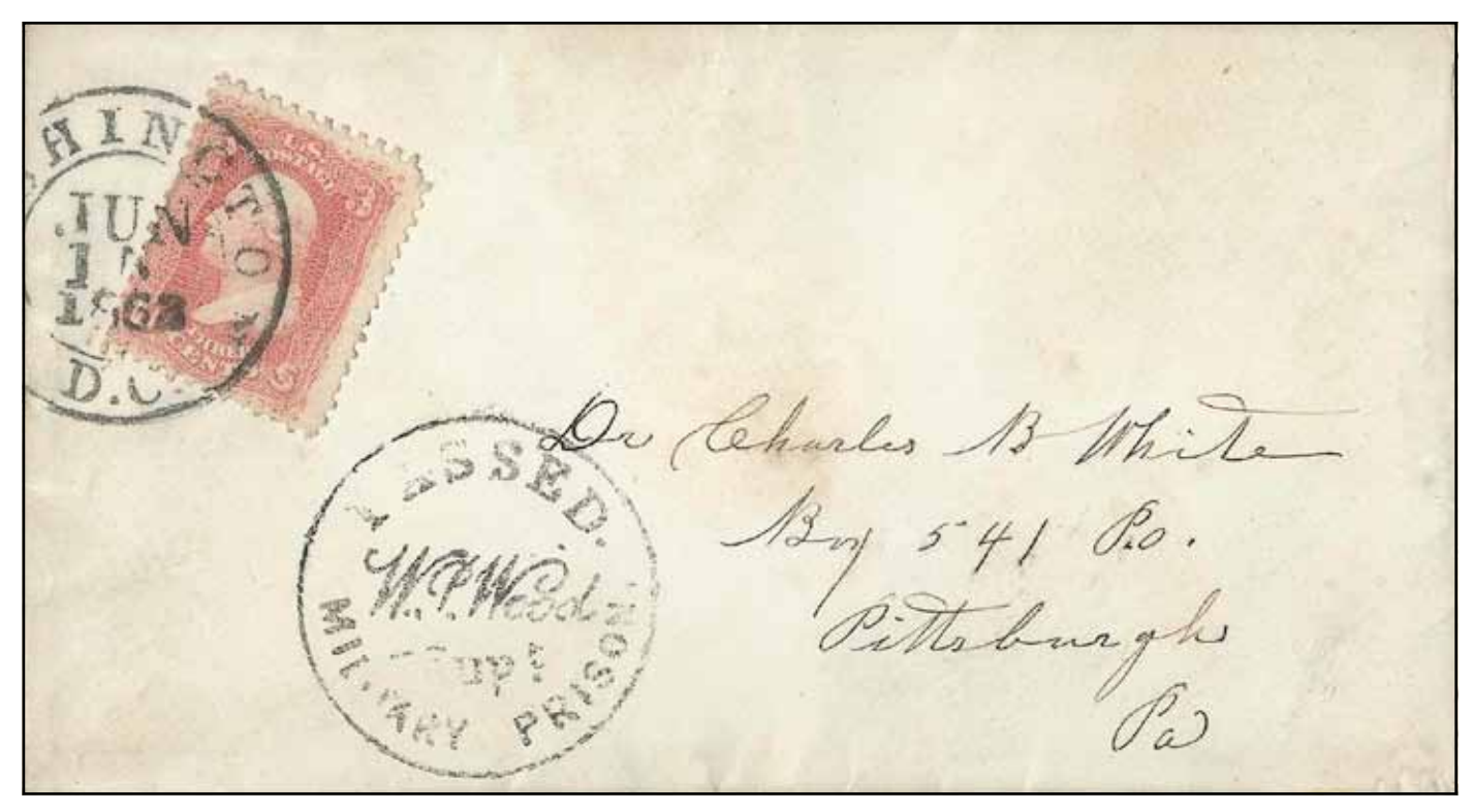
Figure 8: Genuine cover to which a fake W.P. Wood examined marking was applied.