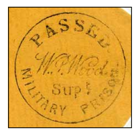
Figure 9: Genuine W.P. Wood examined marking from the cover in Figure 1.

corpus in May 1861. What is commonly referred to as Old Capitol Prison really consisted of two distinct buildings locally known as Old Capitol and Carroll, the latter so named from its having been the property of the distinguished Carroll family. The site is today occupied by the U.S. Supreme Court Building.