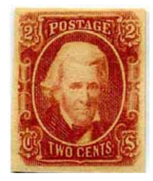
Figure 1: Mint, never hinged Figure 2: An unused example

Andrew Jackson (1767-1845). Jackson was born in the Waxhaws region that straddles North Carolina and South Carolina (exact location unknown) but considered himself a South Carolina native.