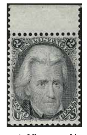
top sheet margin copy of the of the Confederate two-cent U.S. two-cent Black Jack from 'Red Jack' from the author's the Alan B. Whitman collection stock. sold in 2009.

The stamp pictured the seventh U.S. President,