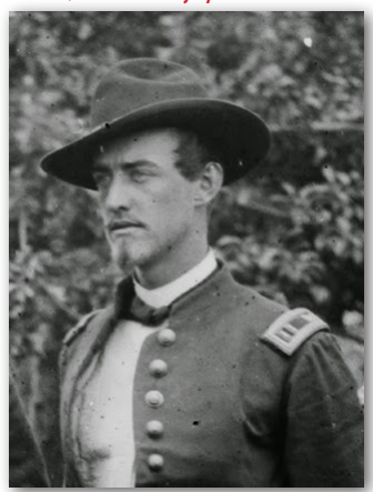
Col. Ulrich Dahlgren, 1863